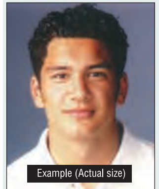
Example (Actual size)